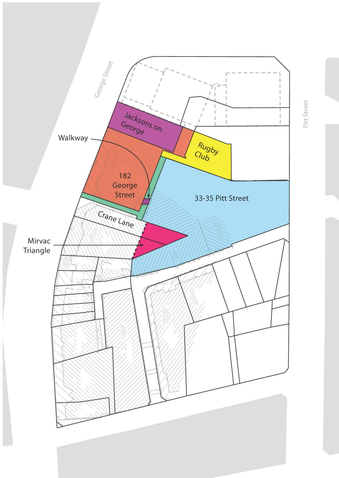
Figure 1: Development Site